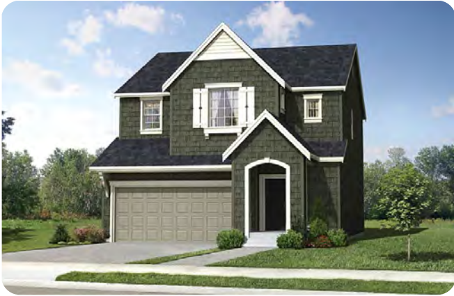
Bridgeport II (1185-5 A) Cedar Shingles with Shutters

With one of the prettiest freshwater shorelines in Washington, Bridgeport State Park is a true gem. Campers enjoy the cooling waters of Rufus Woods Lake and lush lawns in the midst of a desert-like setting in the north central part of the state. "Haystacks," unusual volcanic formations, add to the visual interest and texture of the park.