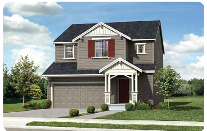
Bridgeport II (1185-5 D) Lap Siding with Columns and Shutters