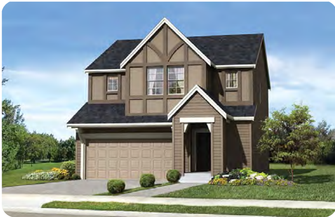
Bridgeport II (1185-5 C) Tudor Style