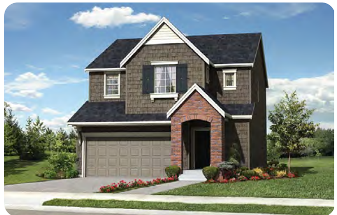
Bridgeport II (1185-5 B) Cedar Shingles with Shutters and Brick