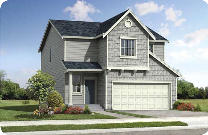
Aspen (1185-3 A) Shingles and Lap Siding

The poetic call of rustling Aspen leaves is perhaps one of the most inviting sounds Mother Nature offers up to us as we hike woodland trails or settle down for a picnic in a Northwest Aspen grove. The soft, smooth, pale bark is equally soothing to the eye and mind. The Aspen is not a large tree, although one in Yorkshire, England is recorded at 130 feet in height with a 3½ foot diameter! One of this tree's biggest fans is the beaver which considers the Aspen bark to be a very tasty treat indeed.