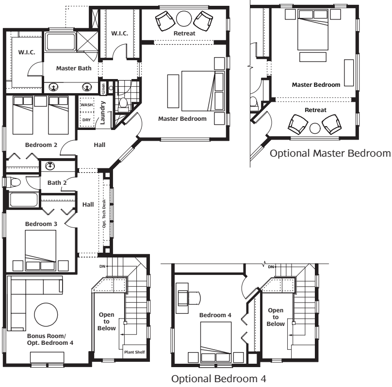
Lopez (1170-0) Upper Floor Plan